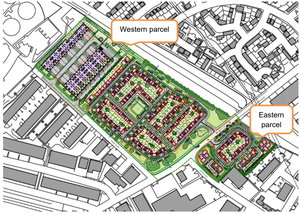
Figure 1.2 - Proposed site layout

which is to be accommodated on the larger western parcel of land. The justification for the proposed approach, which is not in conformity with policies D-AYL115, Rabans Lane either, is addressed in the following paragraphs.