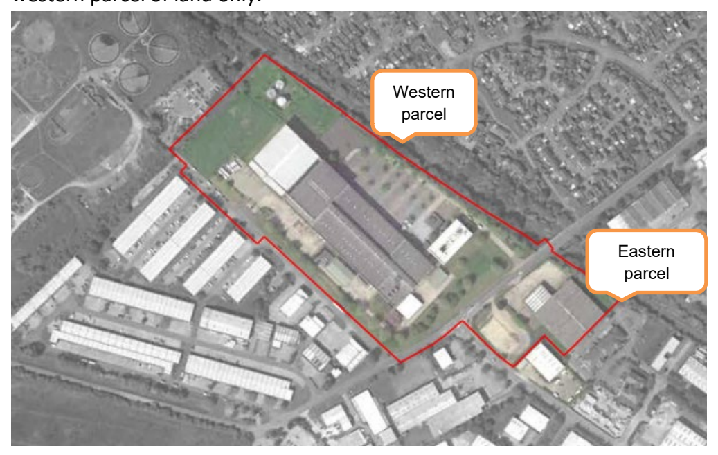
Figure 1.1 – Existing site

6.18 The loss of the existing employment floorspace (c. 22, 575 sqm) from the western parcel of land is accepted. This loss of employment (without replacement) is supported by the VALP site allocation D-AYL115, Rabans Lane, as such this does not require further justification. This site allocation is intended to support planned housing growth, in respect of the western parcel of land only.